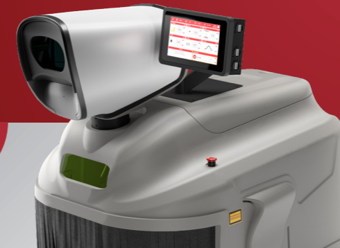
AVAILABLE WITH 3D VISION SYSTEM